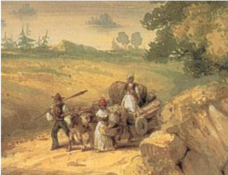
Figure 3: "Bedford Basin near Halifax, by Robert Petley, 1835.

Several historians have produced valuable gender history on African women in freedom. These secondary sources give a broader picture of the general activities and expectations of white women and black women by communities and society. The use of monographs dealing with the workings of black women within Nova Scotia and Sierra Leone before migration is also necessary. Analysis of letters from those who lived in the colony of Sierra Leone offer insight