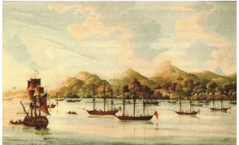
Figure 4: Ships of free slaves from Nova Scotia arrive in Sierra Leone, January 15, 1792.

The images of the women of Nova Scotia illustrate a white gaze on the black body that later generations must contend in Sierra Leone and across the globe. In the illustrations of ship and harbor show the expectations of black peoples that energized their migration and fueled their disappointment. The use of these methods will help unfold a deeper understanding of the black women from Nova Scotia who moved to Sierra Leone.