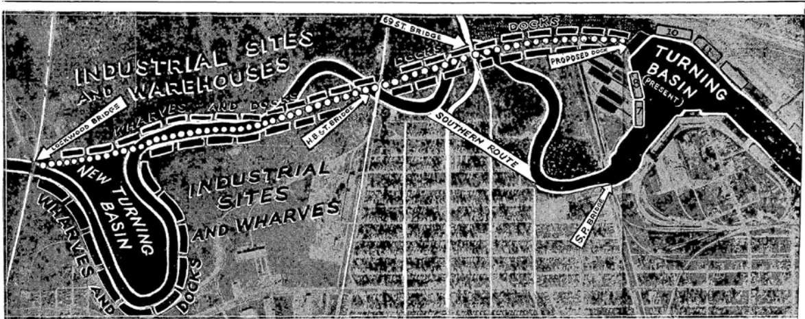
Figure 1: Although never adopted, this 1937 plan reveals the extent to which port officials were willing to go to achieve the infrastructural results they desired, even at the expense of the bayous. 35