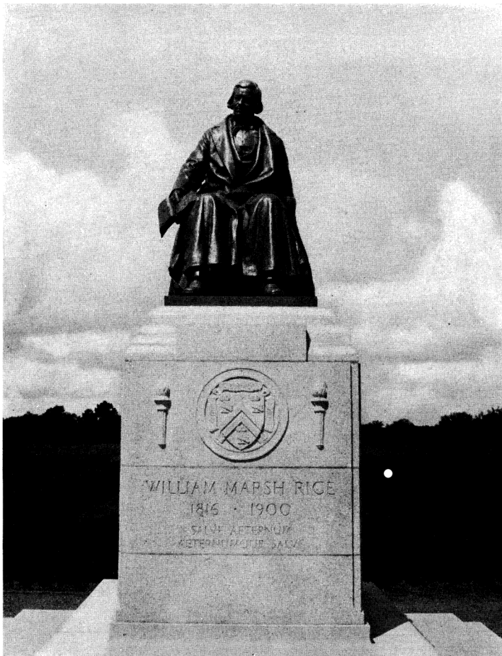
STATUE OF THE FOUNDER