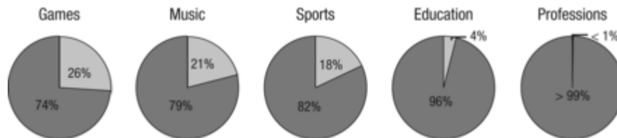
Fig. 3. Percentage of variance in performance explained (light gray) and not explained (dark gray) by deliberate practice within each domain studied. Percentage of variance explained is equal to r^2 \times 100 .

Theoretical moderators. Domain was a statistically significant moderator, Q(4) = 49.09, p < .001 . Percentage of variance in performance explained by deliberate practice was 26% for games ( \bar{r} = .51, p < .001 ), 21% for music ( \bar{r} = .46, p < .001 ), 18% for sports ( \bar{r} = .42, p < .001 ), 4% for education ( \bar{r} = .21, p < .001 ), and less than 1% for professions ( \bar{r} = .05, p = .62 ; see Fig. 3).