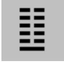
Fu 復 (24) [966666]