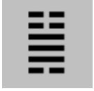
Heng 恆 (32) [699966]