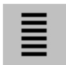
Qian (1) [999999]

NB: Nines represent yang lines; sixes represent yin lines (the first number represents the bottom line)