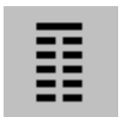
Bo 剝 (23) [666669]