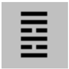
Jiaren 家人 (37) [969699]