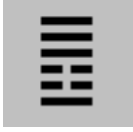
Wuwang 无 妄 [无 望] (25) [966999]