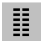
Kun 坤 (2) [666666]