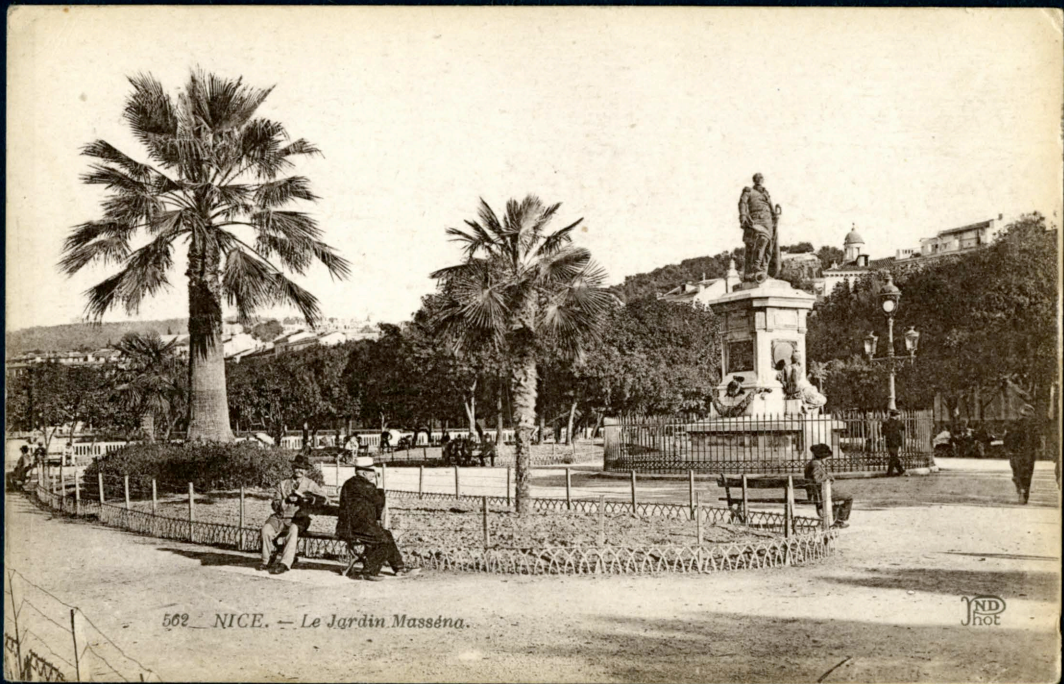
562 NICE. — Le Jardin Masséna.